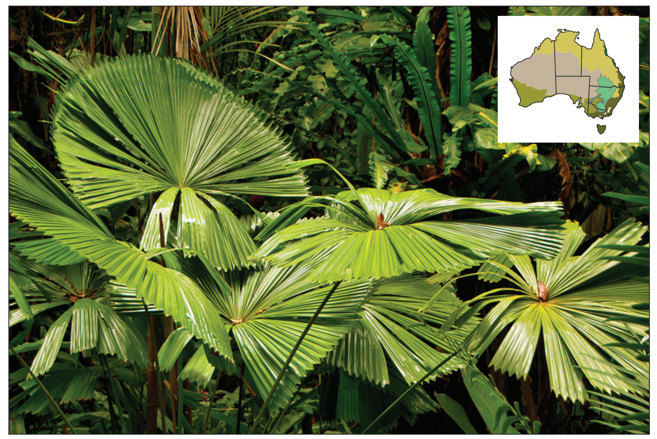
In which region would you be likely to find large leafed ferns?