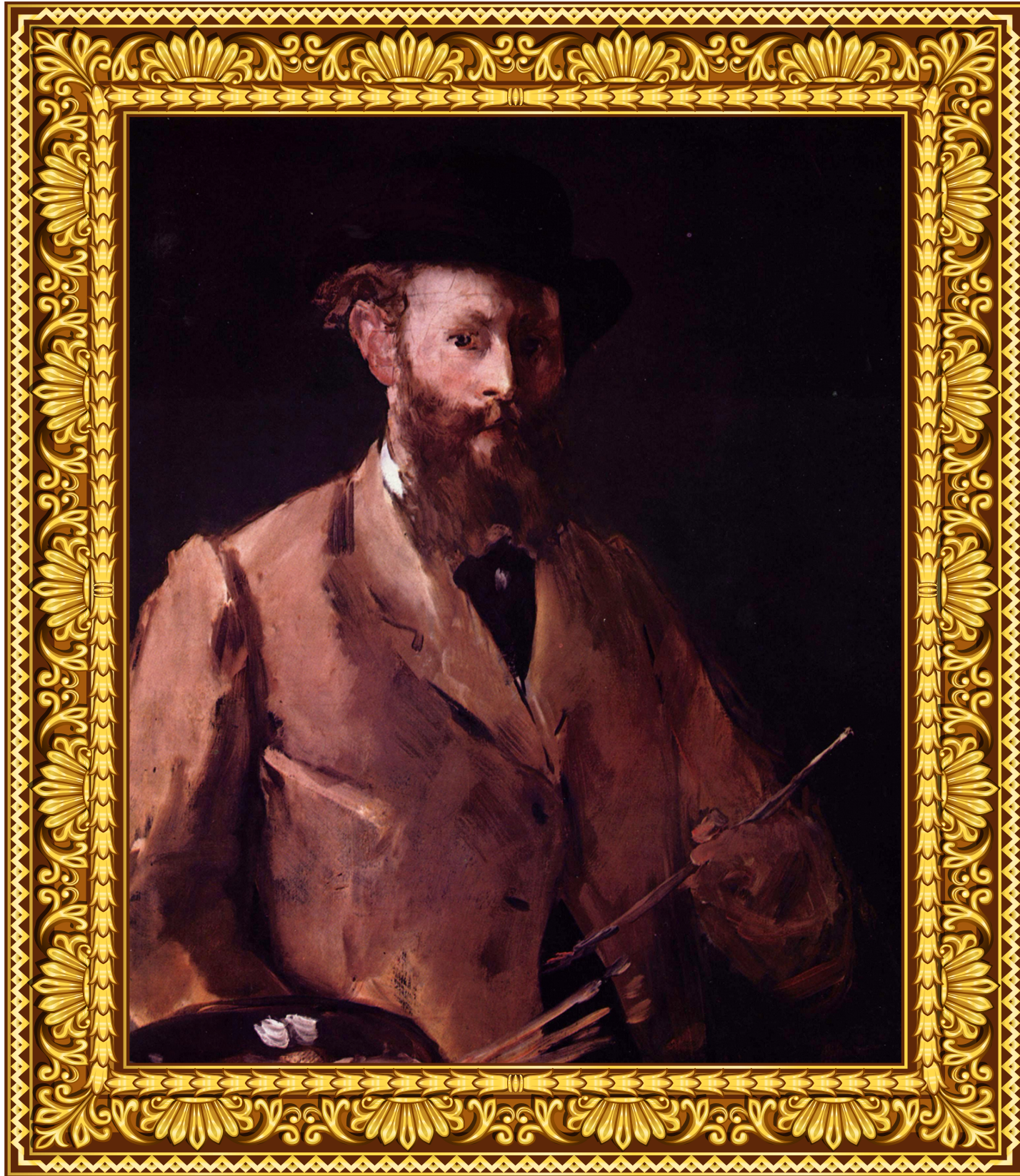
Self-Portrait with Palette, 1878–79. This painting sold on 22 June 2010 at Sotheby's Auction House for $29.48 million.

He is best known for his paintings of Parisian life, especially of people enjoying themselves socially at cafes or concerts. He also used the urban landscape of Paris as a backdrop for many of his paintings. Manet and the other Impressionist painters caused much controversy with their new style.