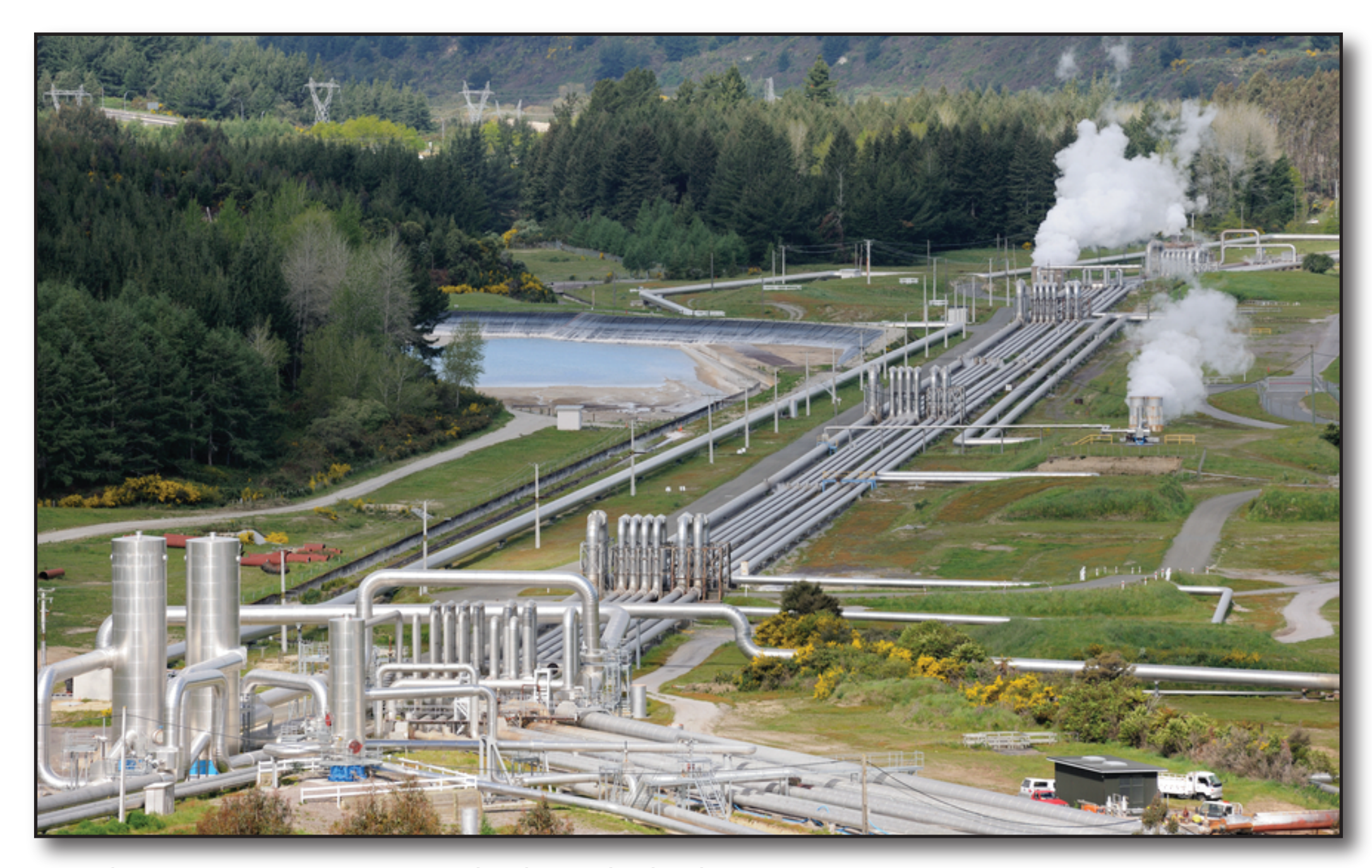
Wairakei Power Station in New Zealand's north island.