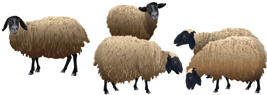
A flock of sheep.

Collective nouns are names for a group or collection of people or things.