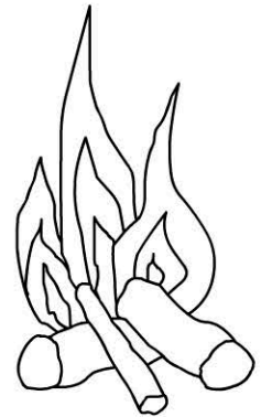
A warm fire.