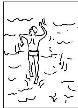
Swimming in cool water.

On a separate page, find an example for each color and draw it.