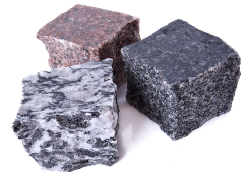
granite samples, different colors

Slower cooling lava can produce rocks with greater crystal content. Examples include granite, gabbro and diorite. The color and texture of the rock depends on the mineral content and the speed of cooling.