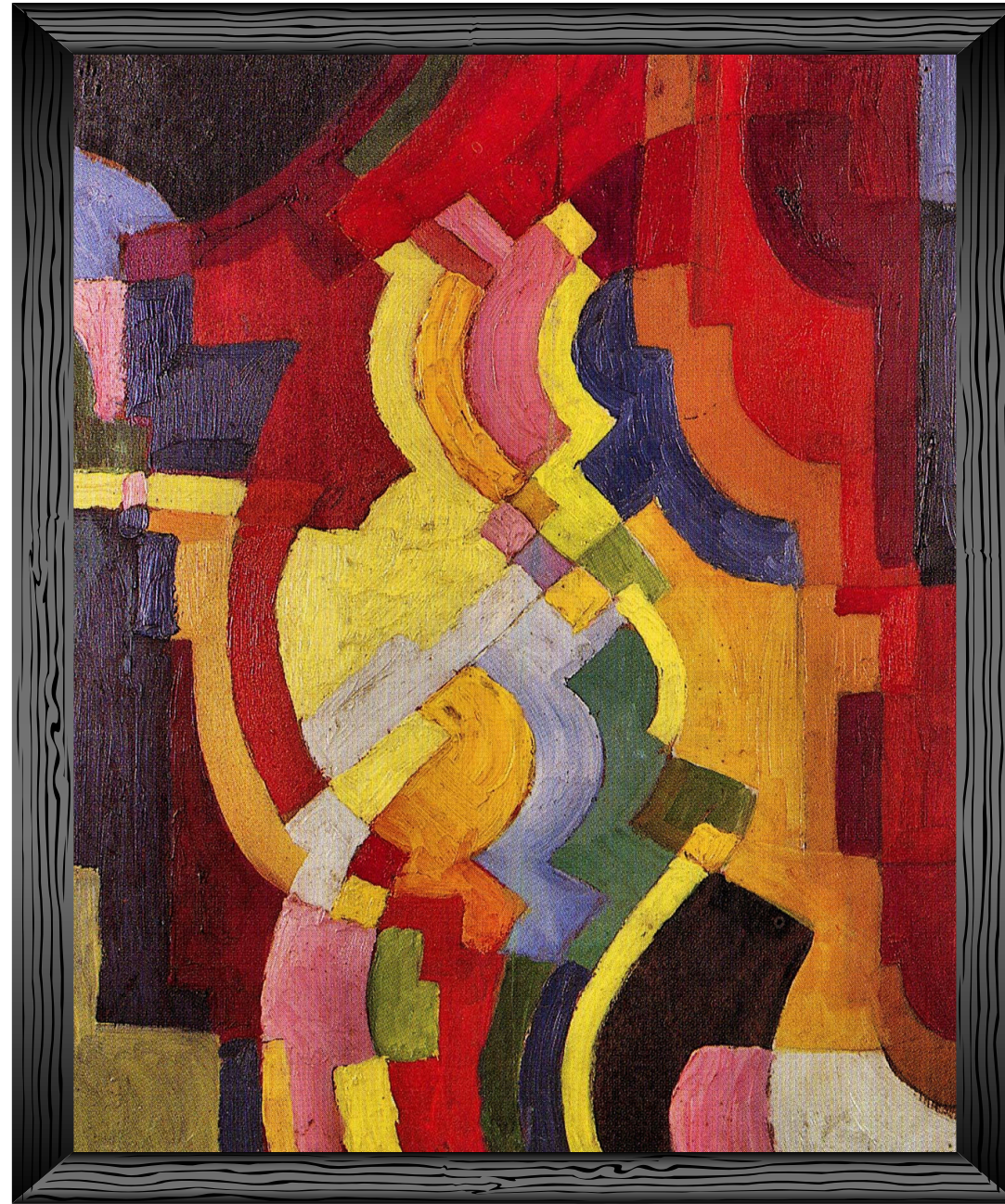
Colored Forms III