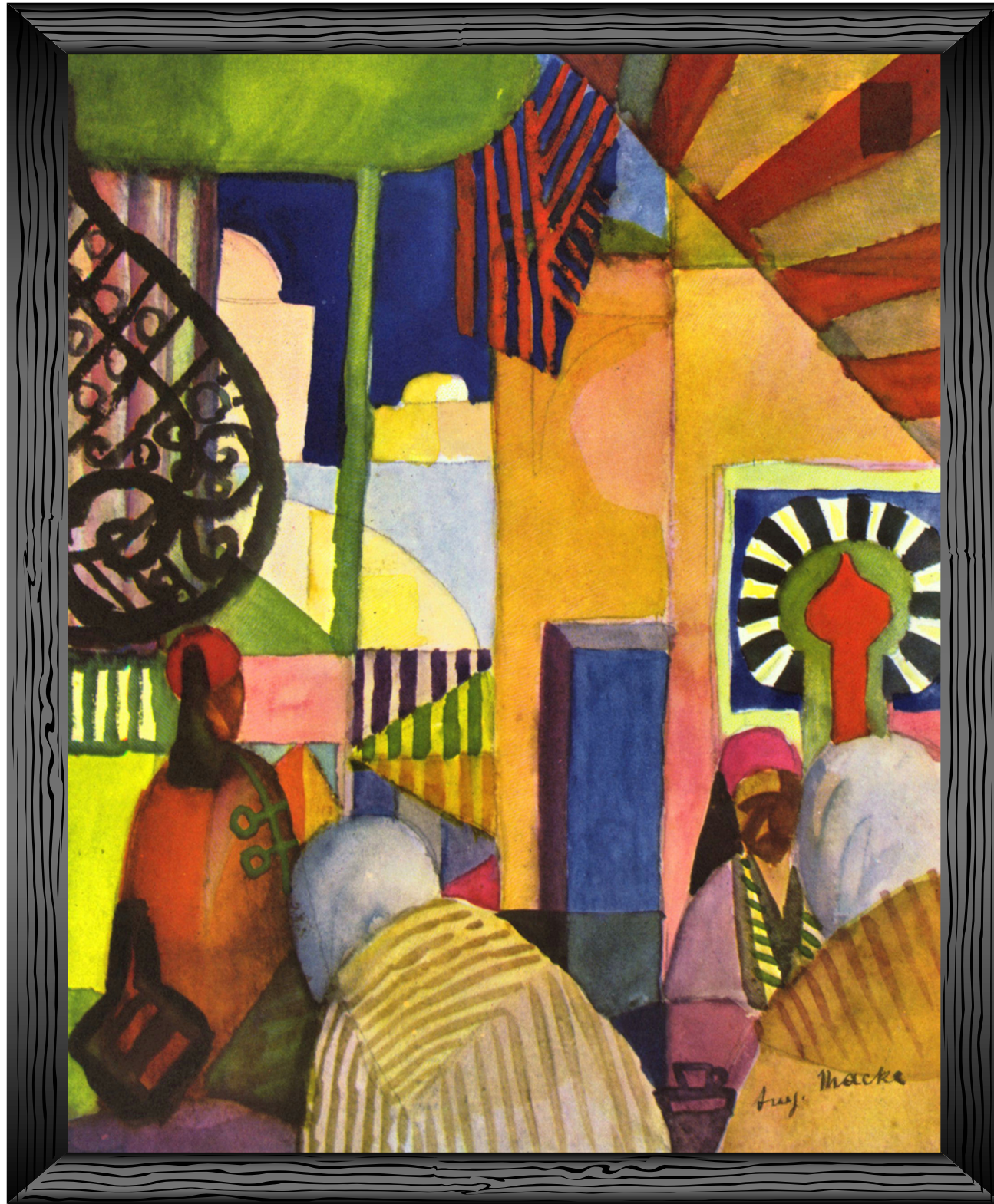
At The Bazaar