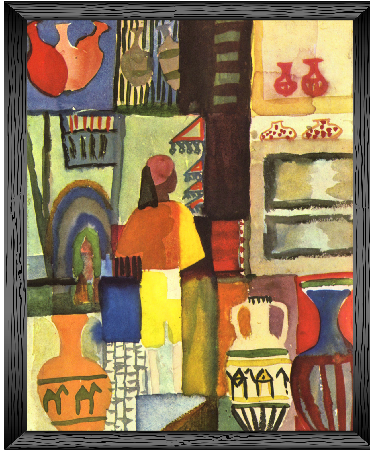
Tunisian Market, (also known as Dealer With Jugs, Traders with Pitchers.)