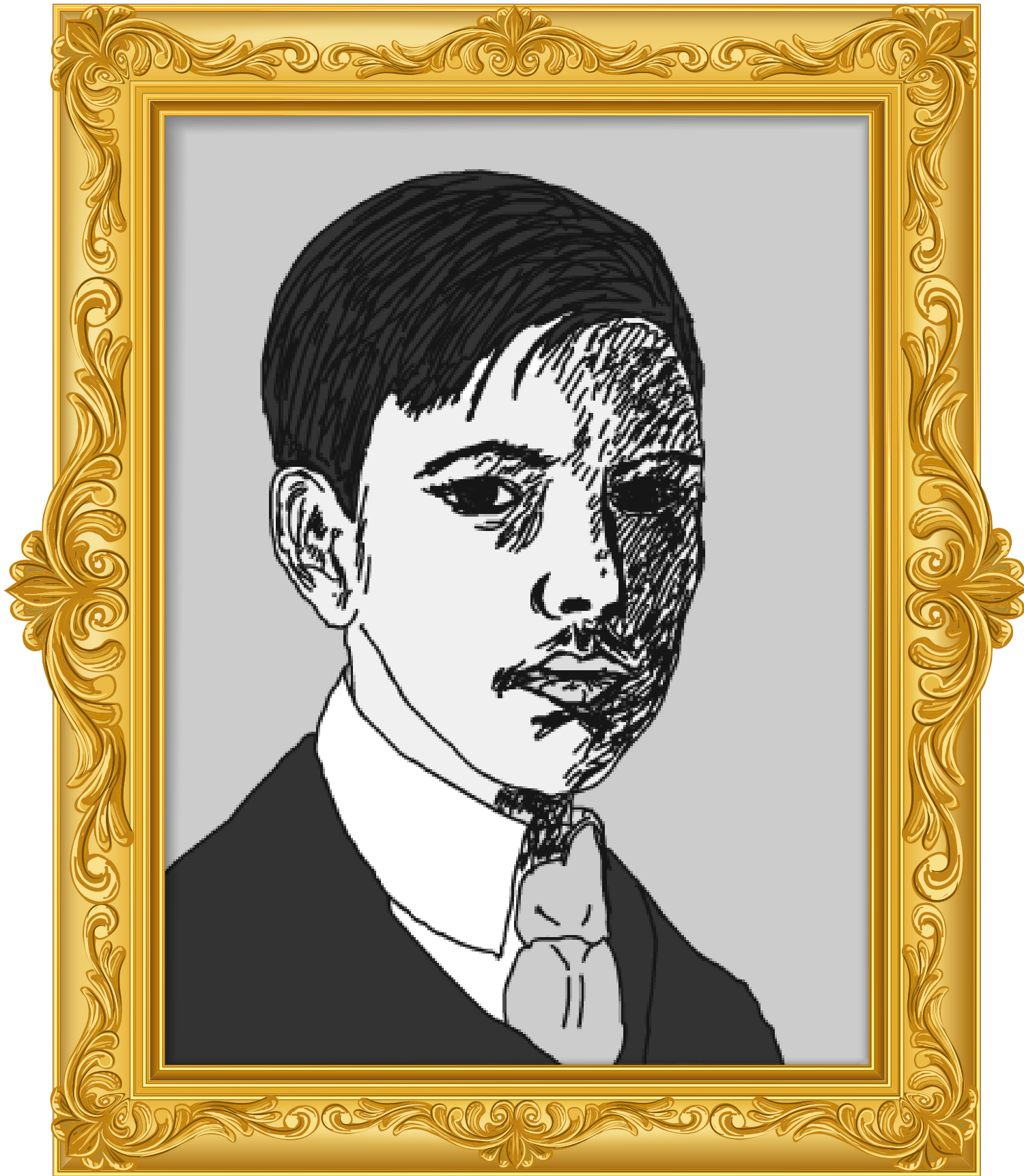
A sketch of August Macke's 1906 self portrait.

Unfortunately, Macke's life was cut short- he died on a WWI battle field in France at the age of 27.