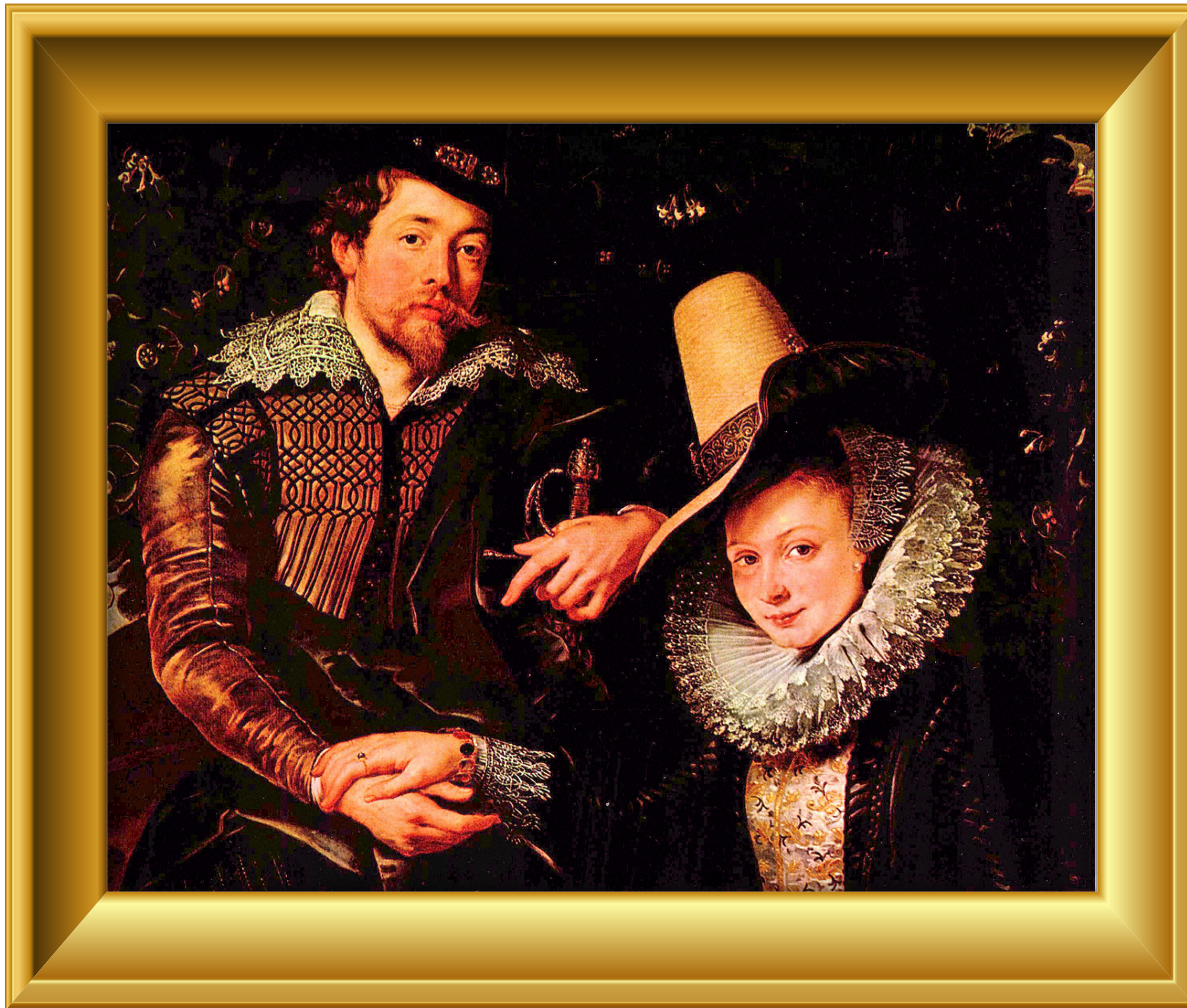
"The Honeysuckle Bower" (a self portrait with his first wife, Isabella Brant.) 1609, Oil on canvas, 178 × 136.5 cm (70 in × 53.7 in) Alte Pinakothek Museum, Munich, Germany

People who could afford to dress in stylish clothes in the 1600s often wore richly brocaded outer clothing with many layers of underclothing. Fancy collars and hats were very popular among men and women of the day.