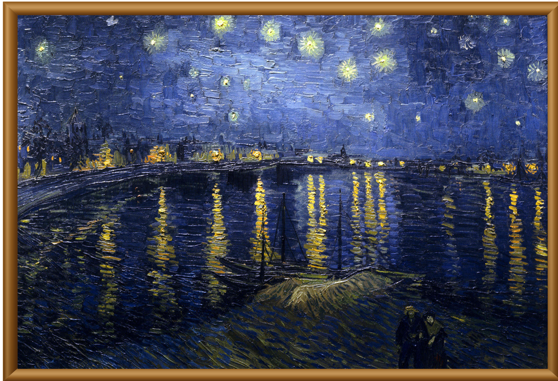
Starry night over the Rhône, 1888