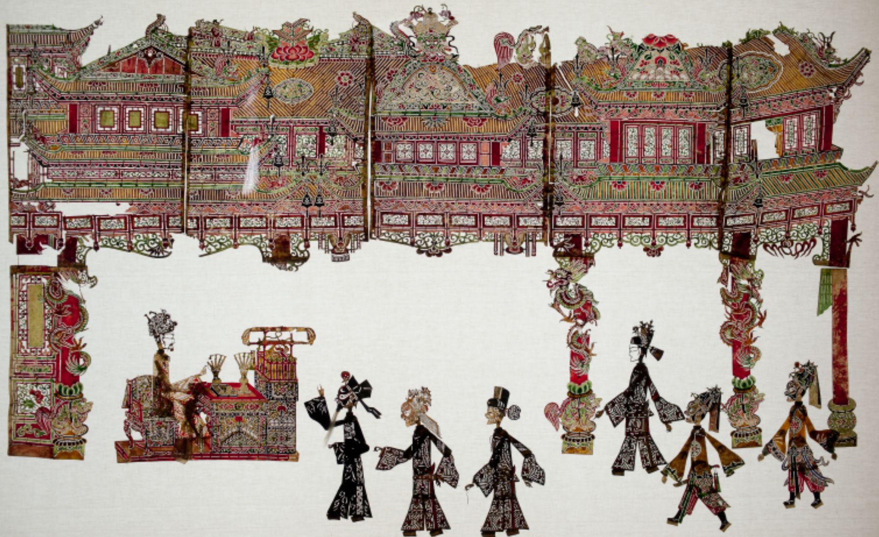
Shadow puppetry can also include intricate sets to help tell stories. This is a Chinese shadow puppet play.